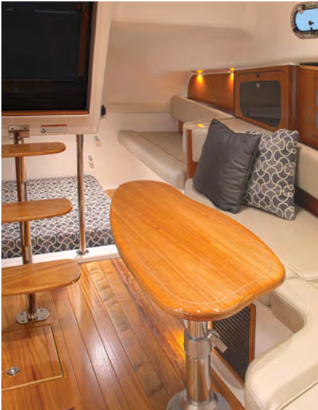
OPTIONAL Interior Arrangement